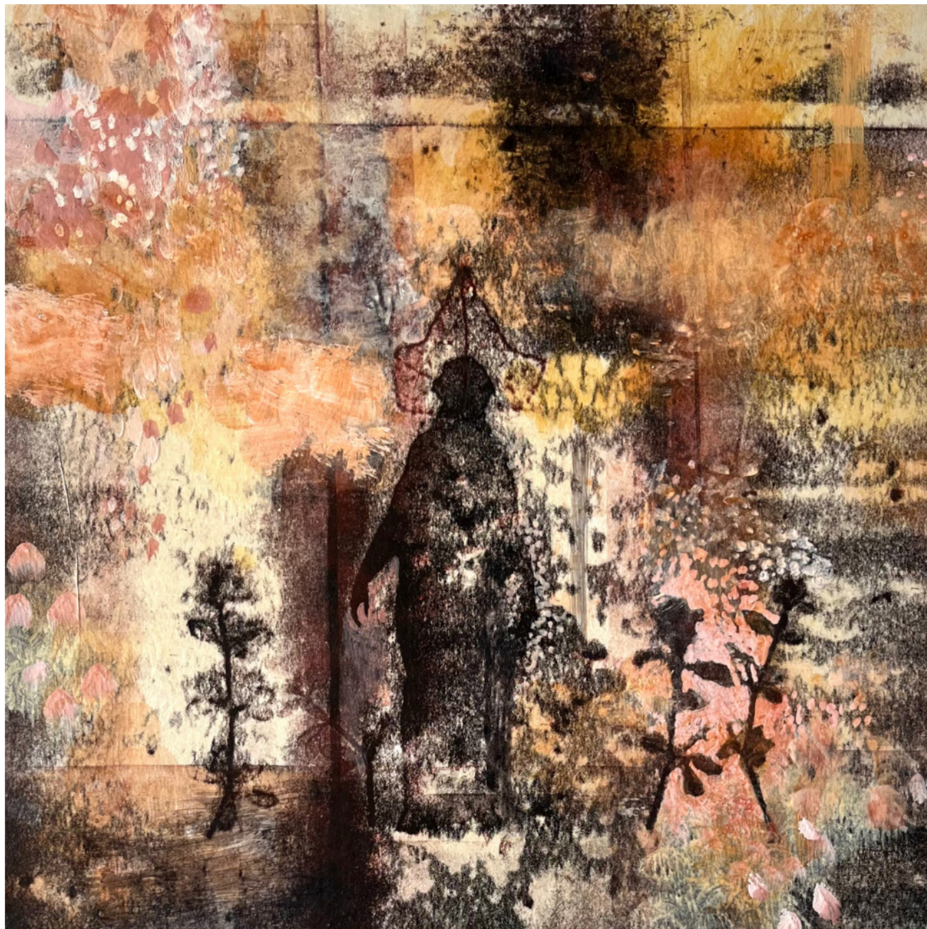
Old Lands, Old Ghosts Egg Tempera, Raw Pigment, Monoprint and Beeswax on Wood 30 x 30 cm