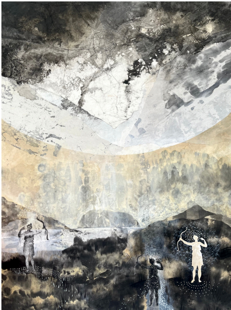
Strange Moon Natural Inks, Collage, Egg Tempera and Beeswax on Wood 76 x 102 cm