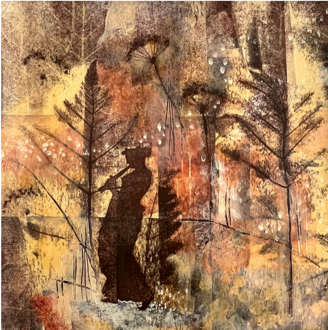
Singing in the Spring

Egg Tempera, Monoprint, Raw Pigment and Beeswax on Card