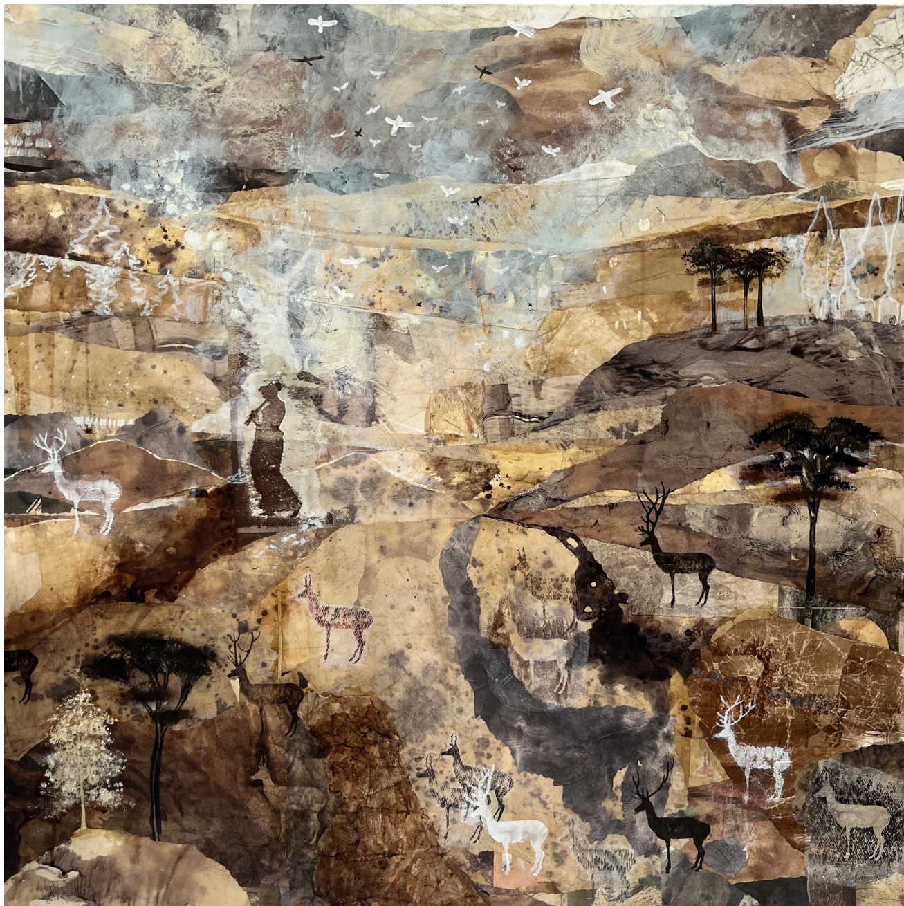
The Ancient Wandering Collage, Natural Inks, Egg Tempera, Raw Pigment and Beeswax on Canvas 1 m x 1 m