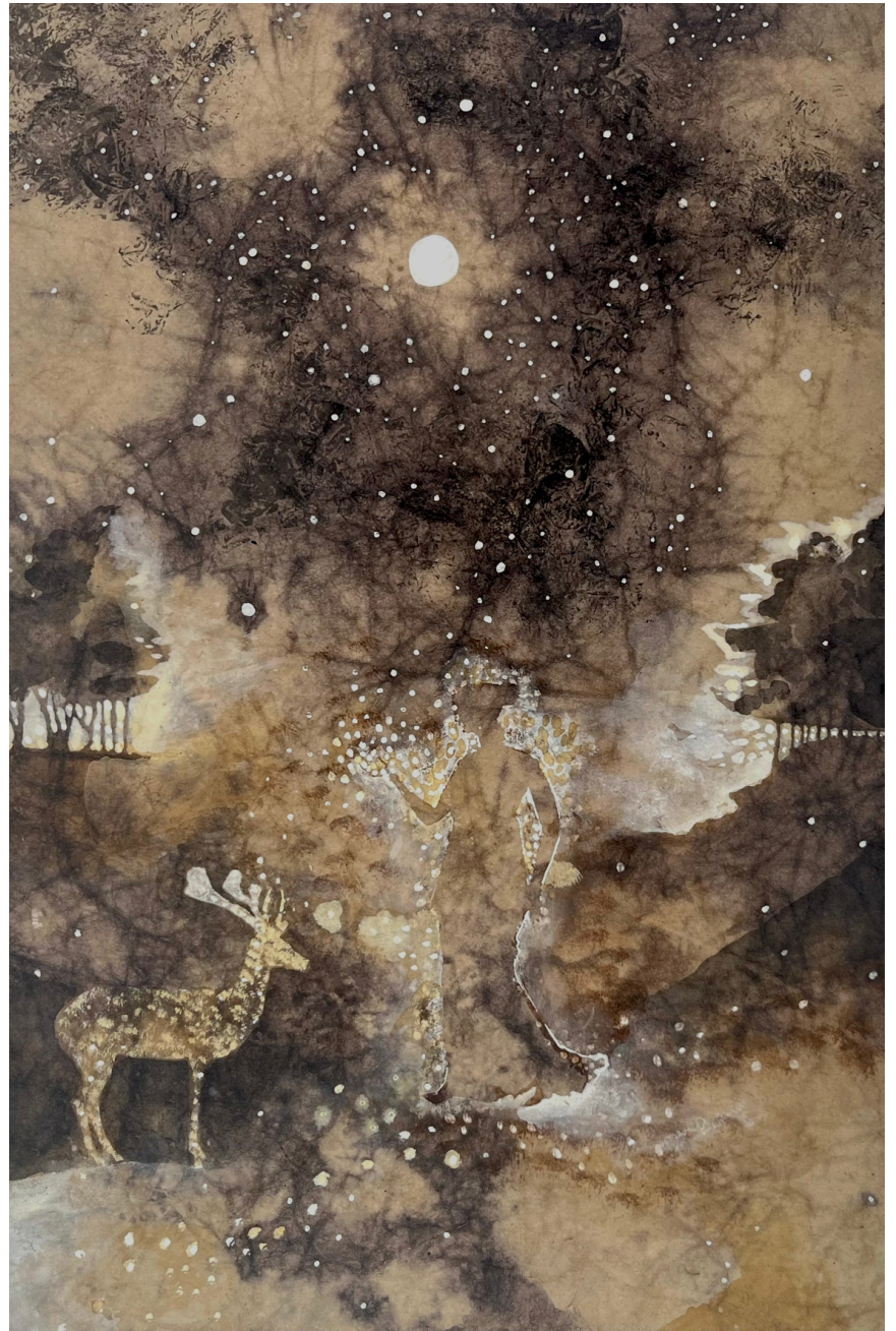
I am a Child of the Starry Heavens Collage, Natural Inks, Egg Tempera and Beeswax on Wood 30 x 45 cm