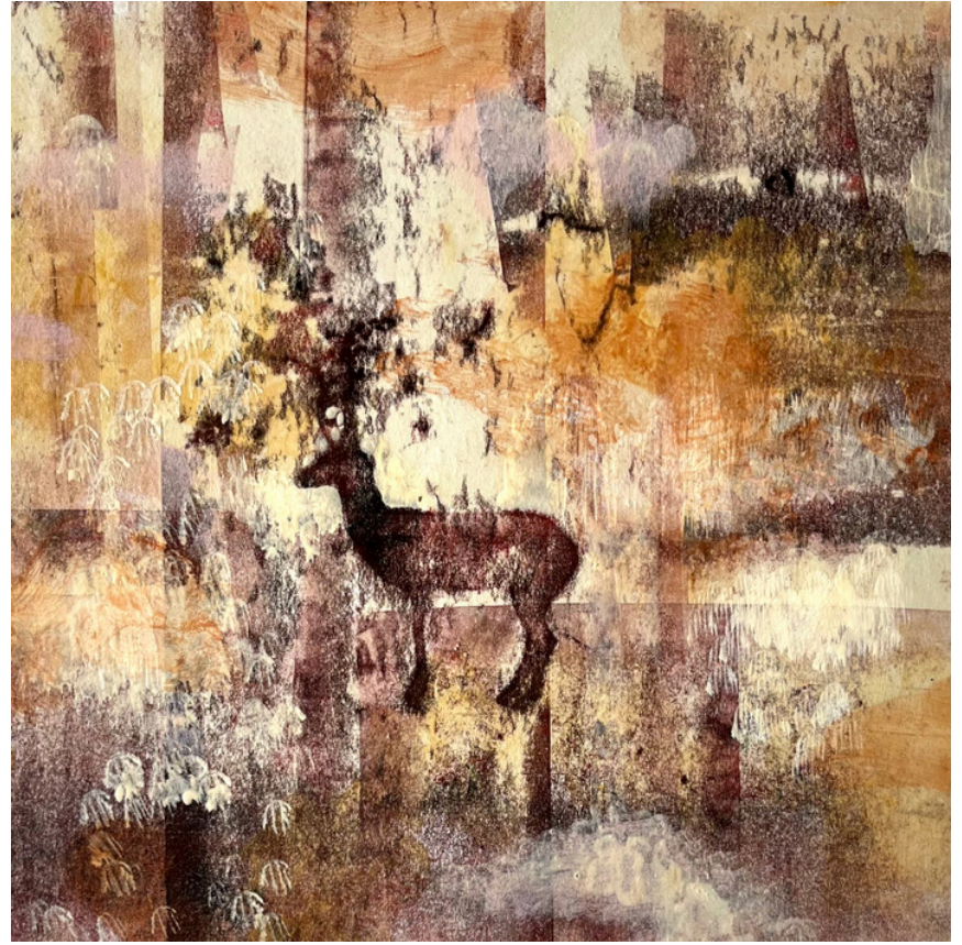
Little Deer Egg Tempera, Monoprint, Raw Pigment and Beeswax on Wood 30 x 30 cm