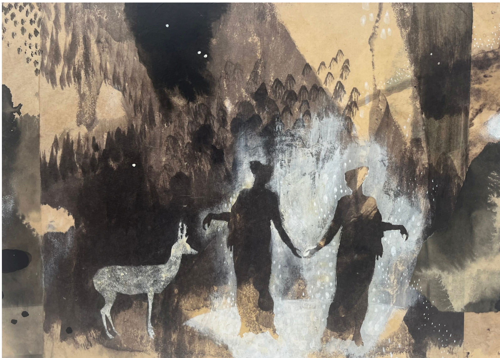
Wyrd Sisters I Collage, Natural Inks, Egg Tempera and Beeswax on Wood 30 x 42 cm