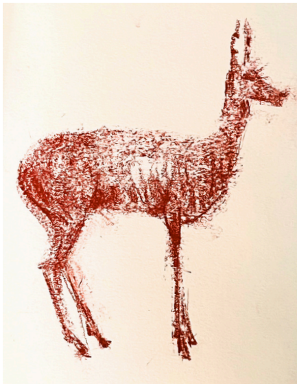
Pompeii Deer Sanguine pastel on paper 18 x 14 cm