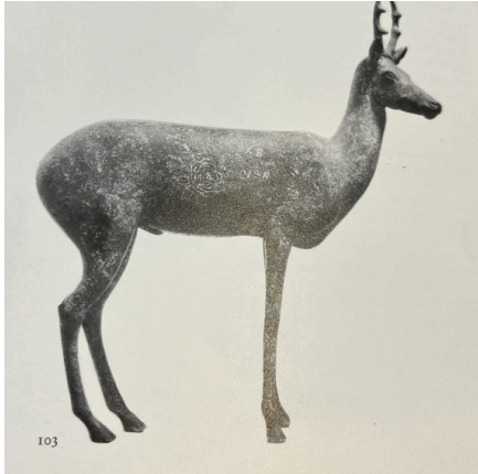
Bronze statue of a deer found in Pompeii