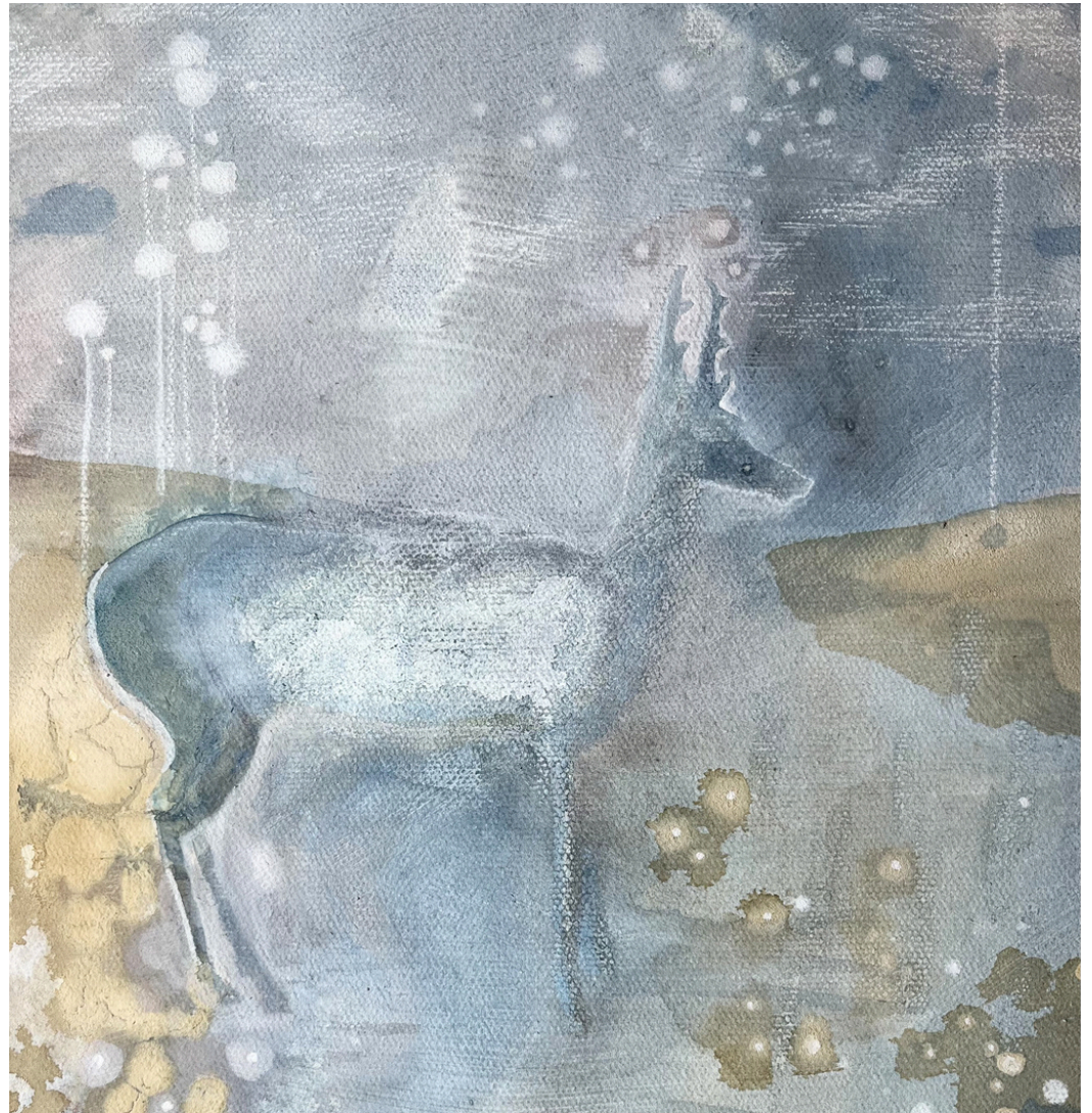
Totem Gesso, pigments, alder cone ink, indigo ink, watercolour, beeswax, marble dust and chalk on canvas 25 x 25 cm