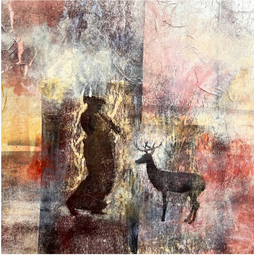
Kindred Egg Tempera, Monoprint, Raw Pigment and Beeswax on Card 30 x 30 cm