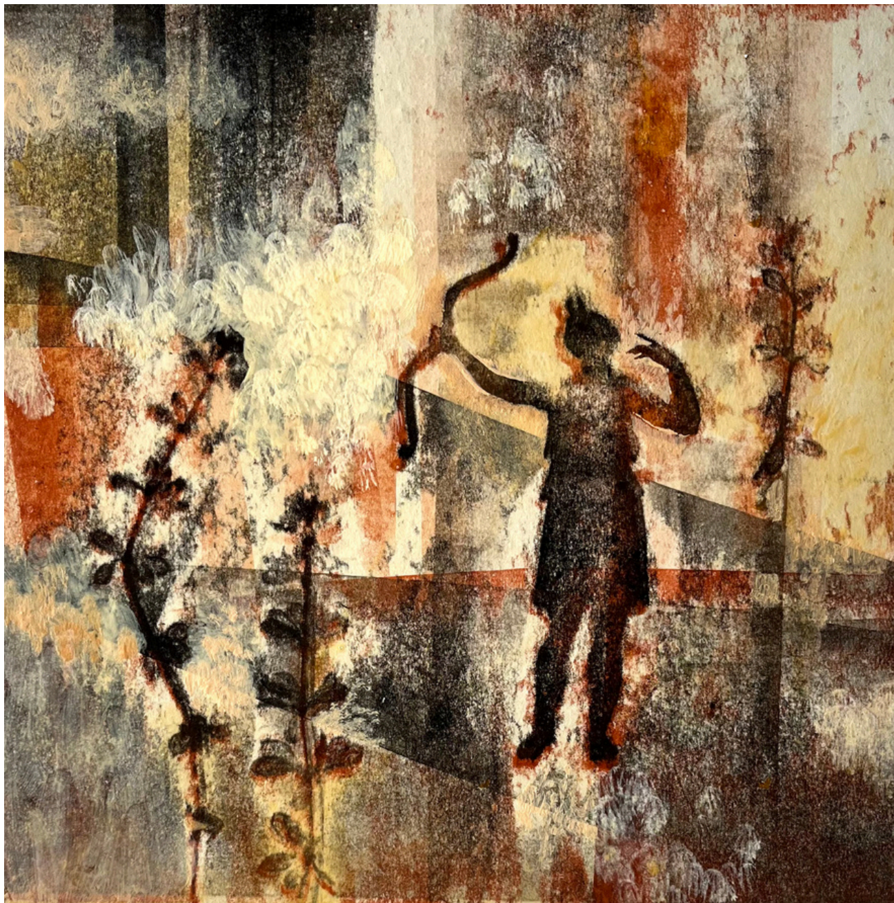
Huntress Egg Tempera, Raw Pigment, Monoprint and Beeswax on Wood 30 x 30 cm