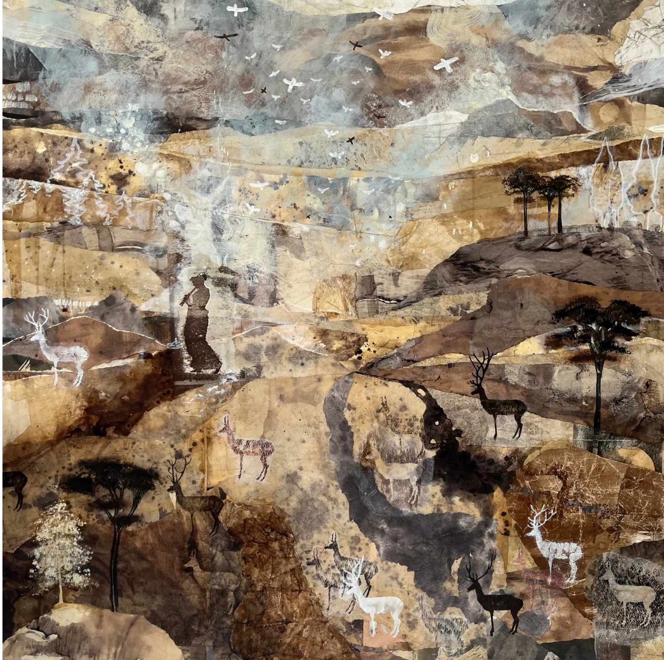
FEE SCROGGIE THESE ANCIENT LANDS