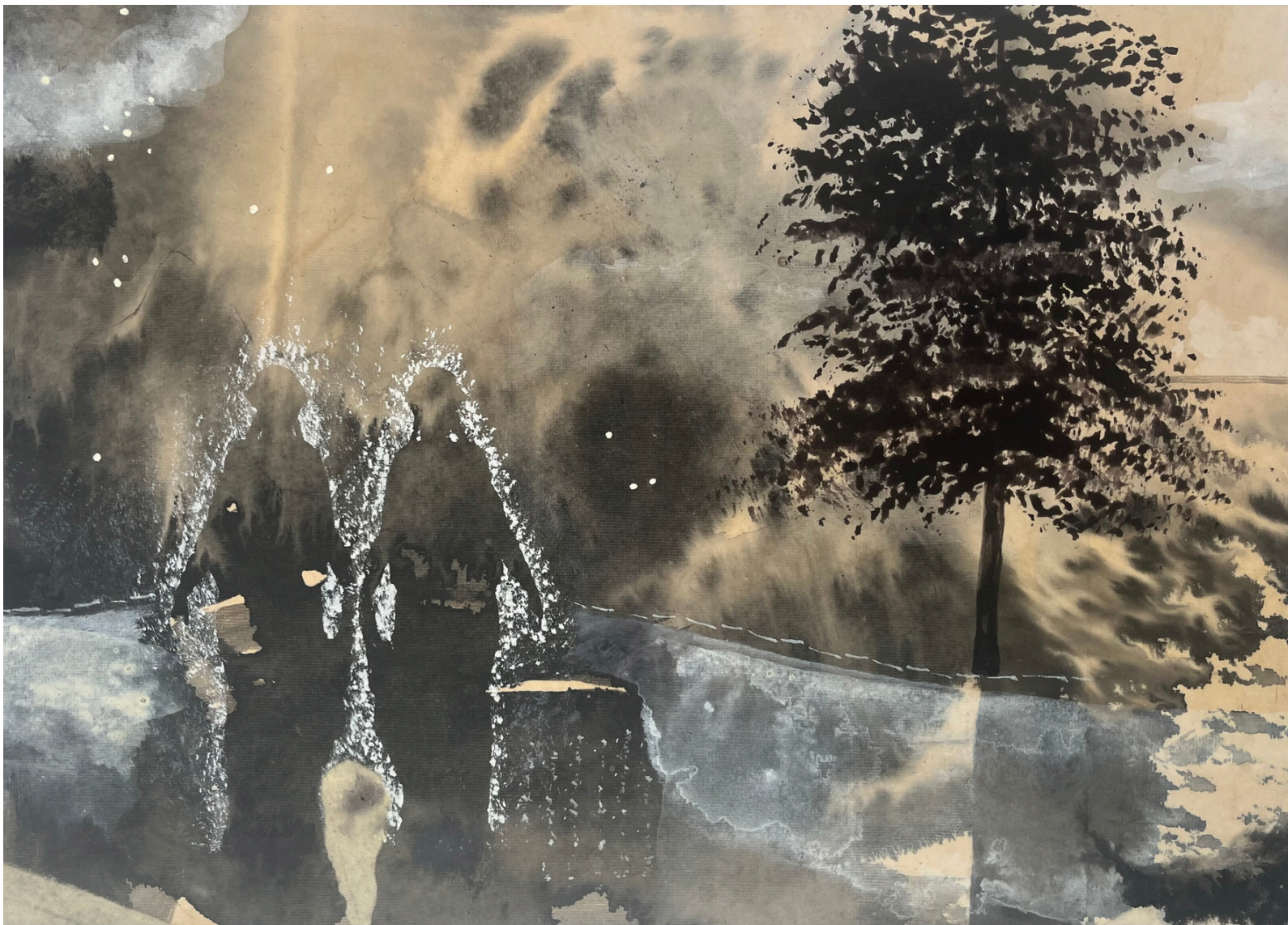
Wyrd Sisters III

Collage, Natural Inks, Egg Tempera and Beeswax on Wood