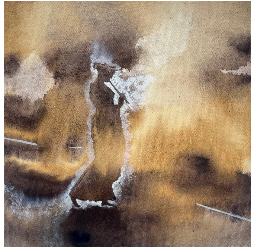
Songweaver Natural Inks, Egg Tempera and Beeswax on Canvas, 26 x 26 cm