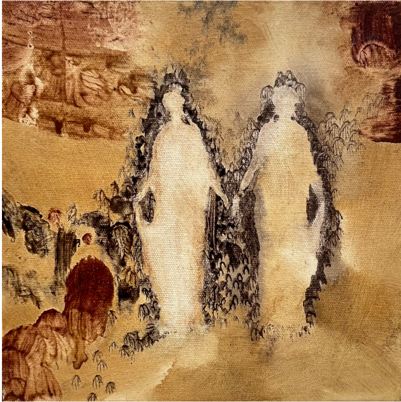
Mirror Mirror Natural Inks, Egg Tempera and Beeswax on Canvas, 26 x 26 cm